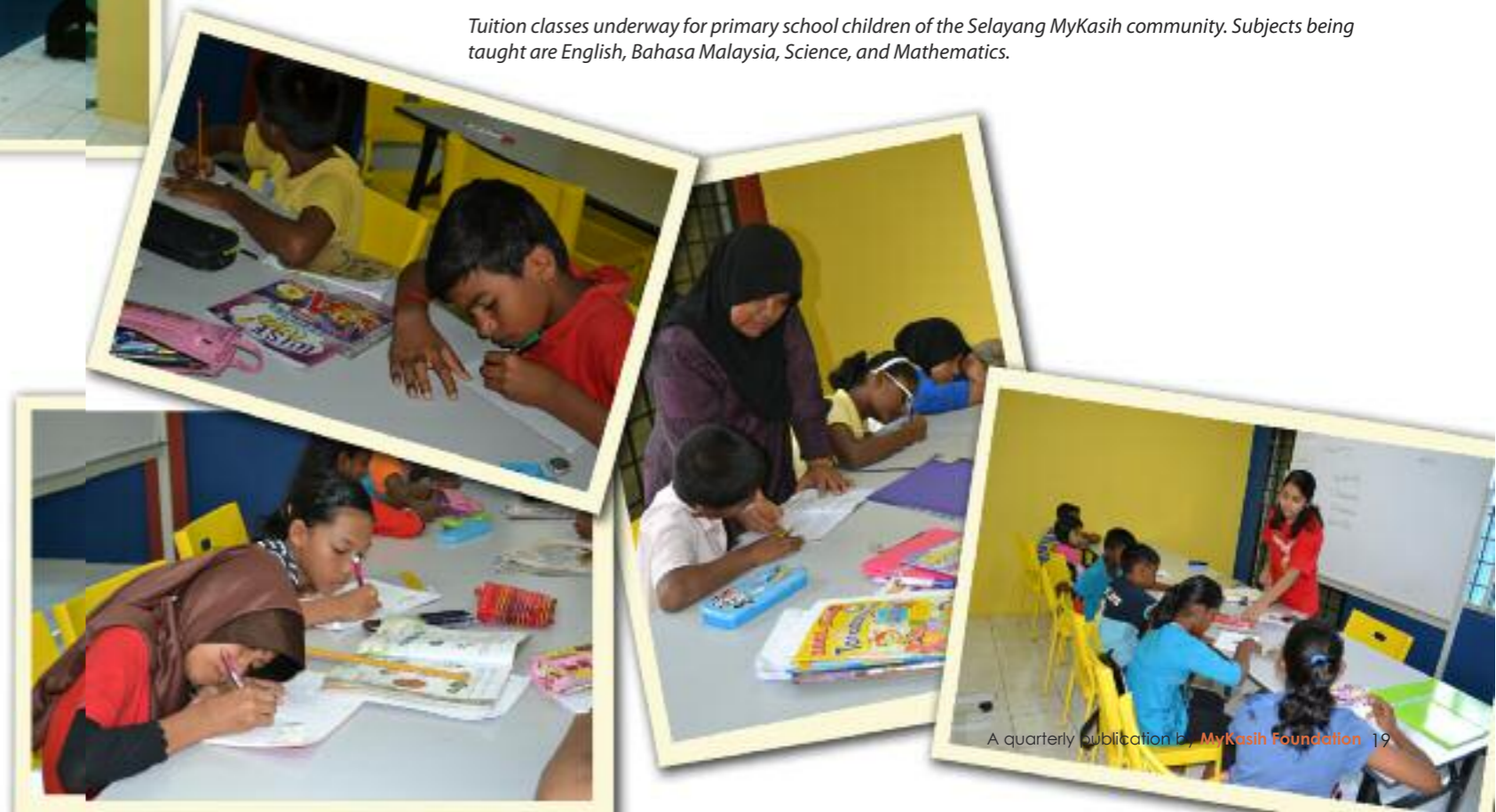
Tuition classes underway for primary school children of the Selayang MyKasih community. Subjects being taught are English, Bahasa Malaysia, Science, and Mathematics.

For more information on how to volunteer with MyKasih, email info@mykasih.com .