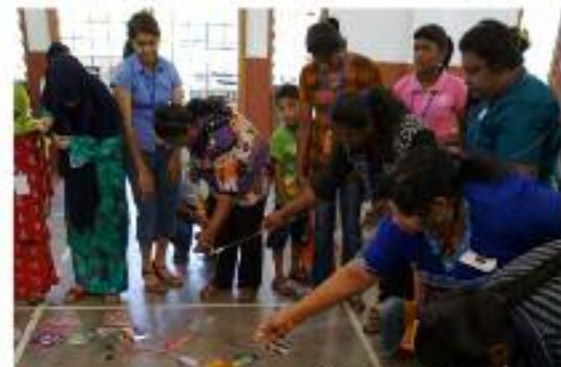
MyKasih recipients put their fishing skills to the test and learn about the value of money during LPPKN's SMARTBelanja workshop.