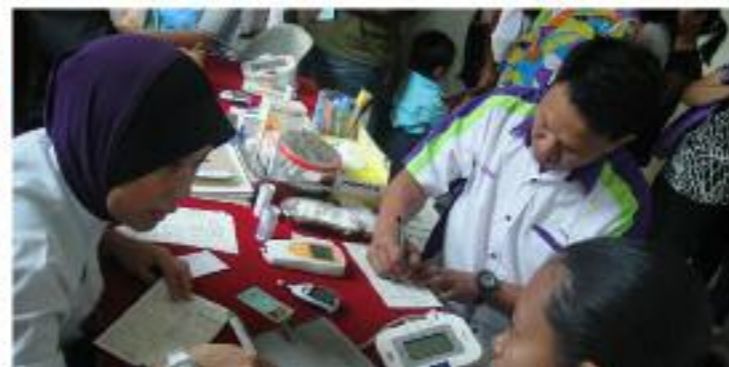
LPPKN officers carrying out basic health services such as blood pressure checks as well as glucose and cholesterol tests.

MyKasih's recipients participate in activities such as health awareness and finance management workshops organized by the National Population and Family Development Board, locally known as Lembaga Penduduk dan Pembangunan Keluarga Negara (LPPKN). LPPKN is an agency under the Ministry of Women, Family and Community Development of Malaysia with a mission to develop communities by focusing on strengthening family institutions.