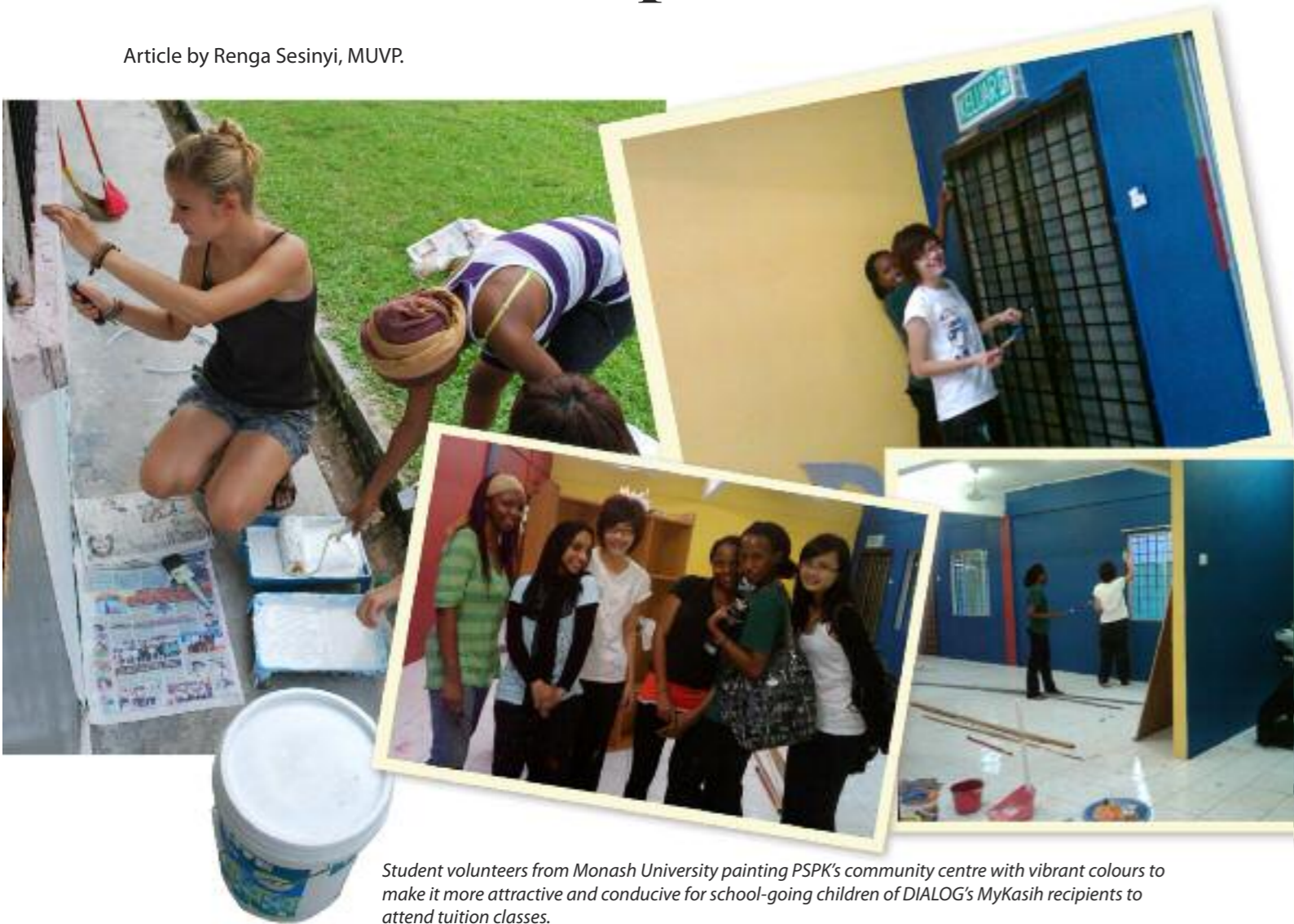
Student volunteers from Monash University painting PSPK's community centre with vibrant colours to make it more attractive and conducive for school-going children of DIALOG's MyKasih recipients to attend tuition classes.

DIALOG Group supports 66 under-privileged families in Selayang, Kuala Lumpur, since 2009 under the MyKasih 'Love My Neighbourhood' food aid programme. As part of its commitment to help the families step out of poverty, DIALOG is supporting a tuition programme for school-going children in that community.