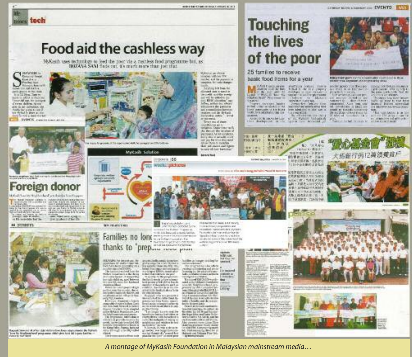
A montage of MyKasih Foundation in Malaysian mainstream media...