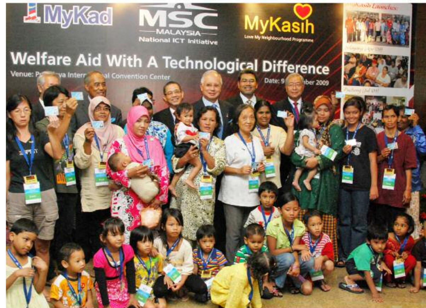
Prime Minister Datuk Seri Najib Razak launched MyKasih's food aid programme at an event held on November 9th, 2009, in Putrajaya