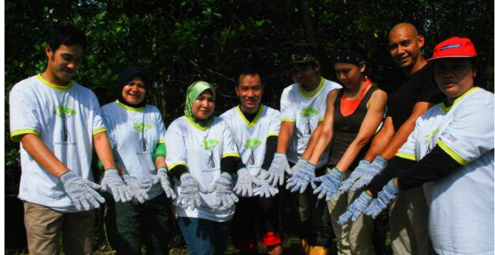
Volunteers lending Mother Nature a helping hand by planting mangrove seedlings in conjunction with Earth Hour.