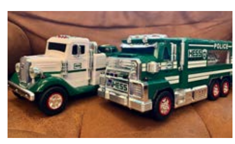
Hess Asia distributed their limited edition collectible toy trucks to the student beneficiaries of SK Parang Puting, with the hope that it would foster passion for STEM.

District Education Departments as well as the school's Parent-Teacher Association. The charitable giving was commemorated with a Back-To-School distribution and a ribbon-cutting ceremony at the school's aquaponics edible garden.