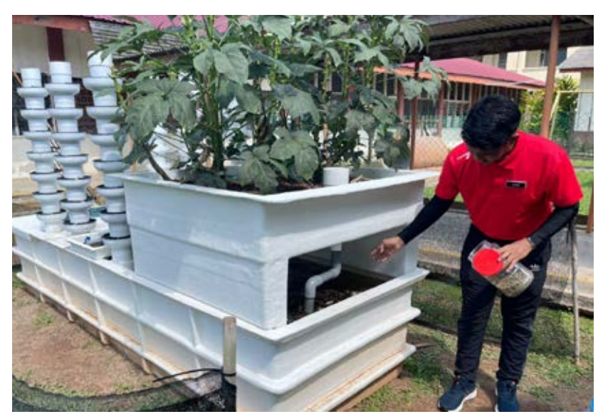
Each system has the capacity to grow 420 vegetables on its 6 vertical pillars, dozens of fruits and herbs on the grow beds, and rear up to 50 freshwater fishes in its tank. Four months after receiving their aquaponics sets, the 15 beneficiary schools have successfully harvested a total of 110kg of healthy greens.