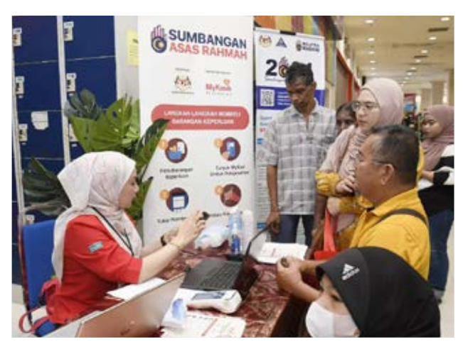
SARA recipients getting confirmation on their eligibility status at the registration counter. Eligibility for SARA is based on the hardcore poor and poor segments of the Malaysian population and are listed in both the ICU-JPM eKasih and the Sumbangan Tunai Rahman (STR) database under the Inland Revenue Board.