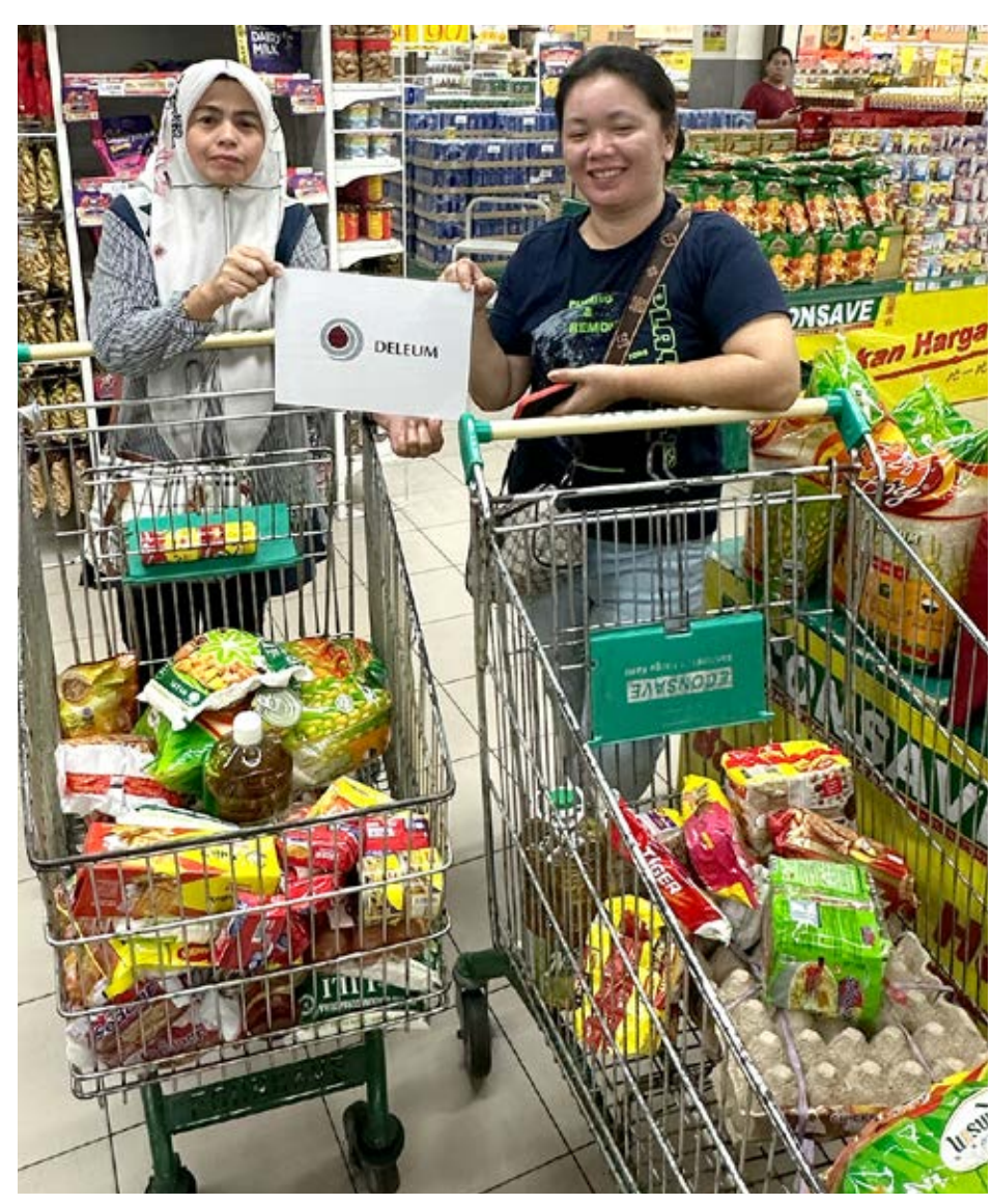
Recipients showing their appreciation to Deleum for filling their shopping carts with food.