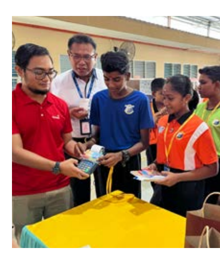
SJKT Castlefield students trying out the cashless payment system with their new MyKasih smartcards.

students in four schools supported with bursaries