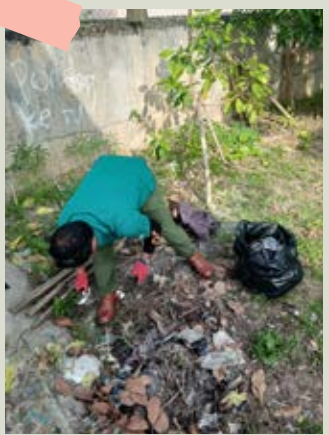
Volunteers rotated between cleaning up the areas close to the riverbanks and sorting recyclable plastics.