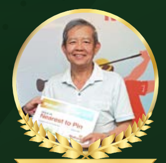
Nearest To Pin