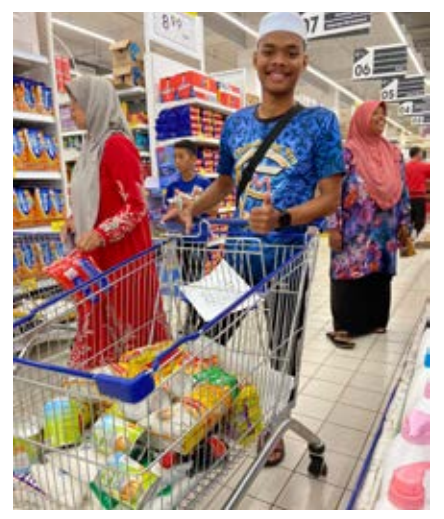
Recipients are able to shop for a variety of food items such as floor, sugar, noodles and many more.

cookies purchased and distributed to 30 welfare homes and underprivileged communities