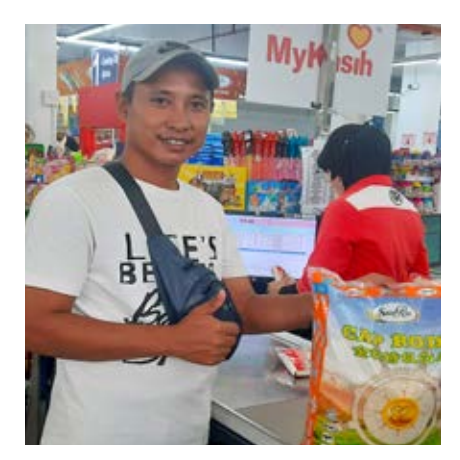
Common essential food items such as rice and noodles are among the products included under the cashless food aid programme.