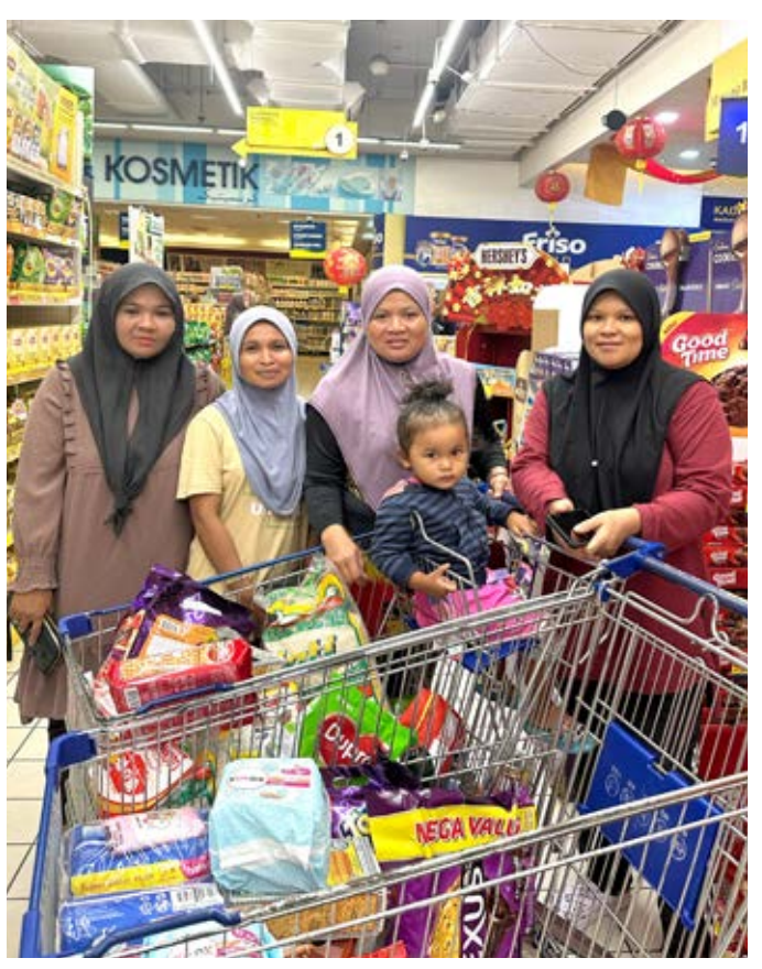
For mothers with young children, a portion of their monthly SARA allocation could go towards infant formula and diapers.