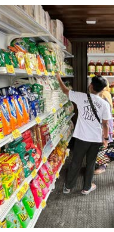
Recipients under the cashless food aid programme are able to choose from a wide variety of essential food items.