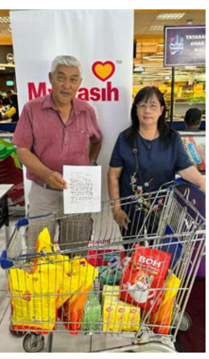
Recipients receive a guide on product categories that are allowed for purchase under the cashless food aid programme.