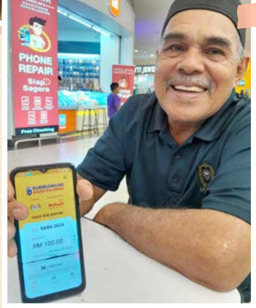
The use of MyKad for welfare distribution is widely accepted by both recipients and merchants who find it efficient, secure and user-friendly.