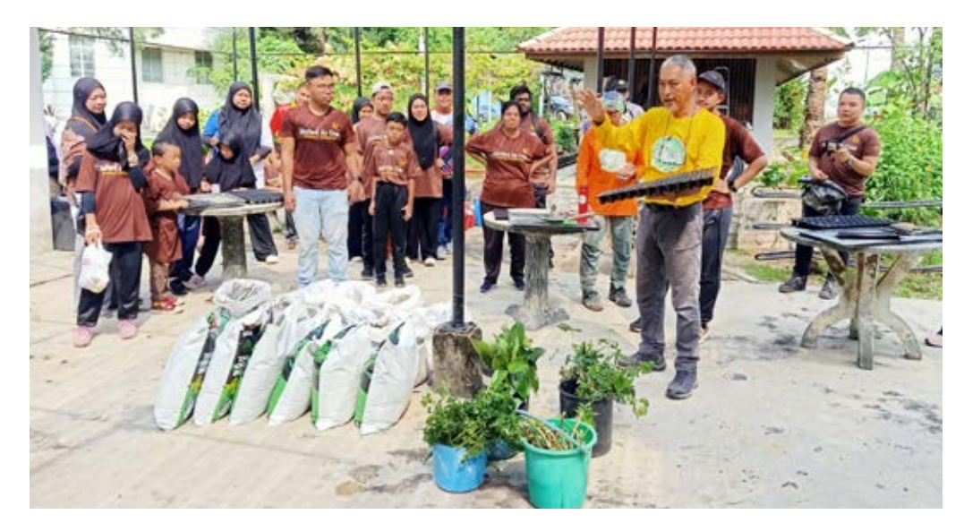
Volunteers also germinated seeds and propagated cuttings of herbs and vegetables which were later planted at the Horticulture Centre in Victoria Institution Kuala Lumpur by the horticulture club members.