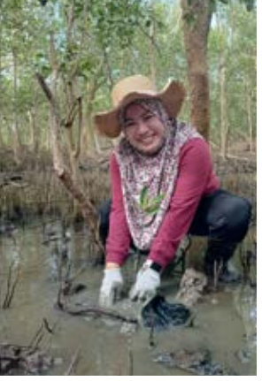
As part of its global climate action, UPS pledges to plant 50 million trees around the world by 2050 to help improve the quality of life, health and safety of communities.