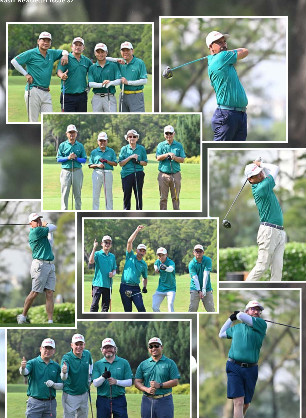
Thank you for your support!