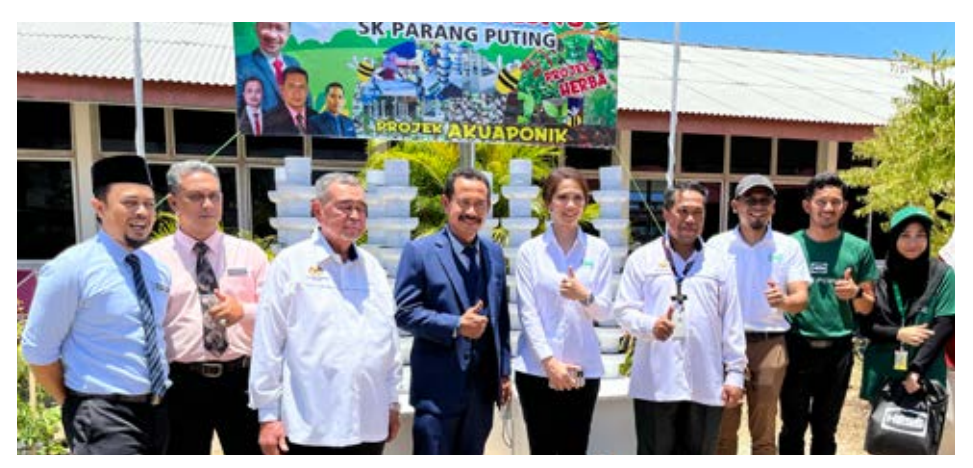
The aquaponic systems are placed in the school's science garden, a dedicated outdoor STEM education space.