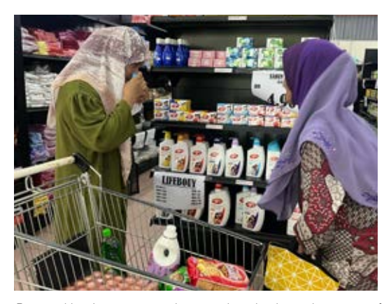
Personal hygiene care products such as body wash are one of the approved items under the post-flood relief programme.