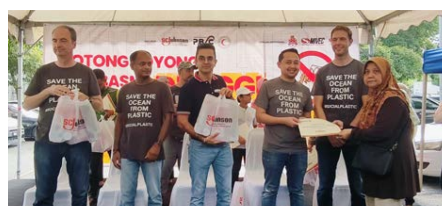
The SC Johnson team distributing household goods to residents of PPR Sri Cempaka.