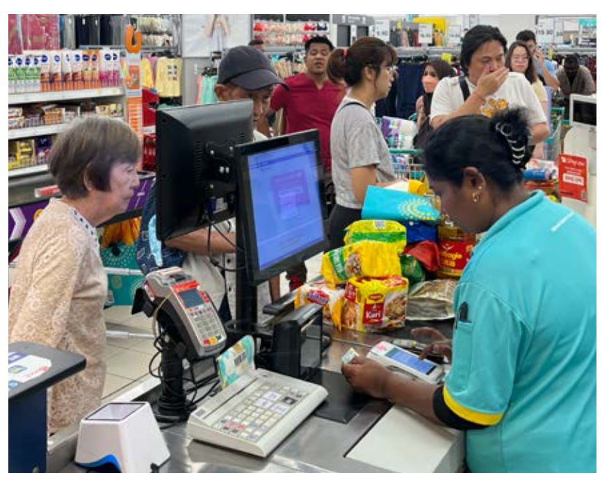
A cashier verifying the identity of the beneficiary through her MyKad.