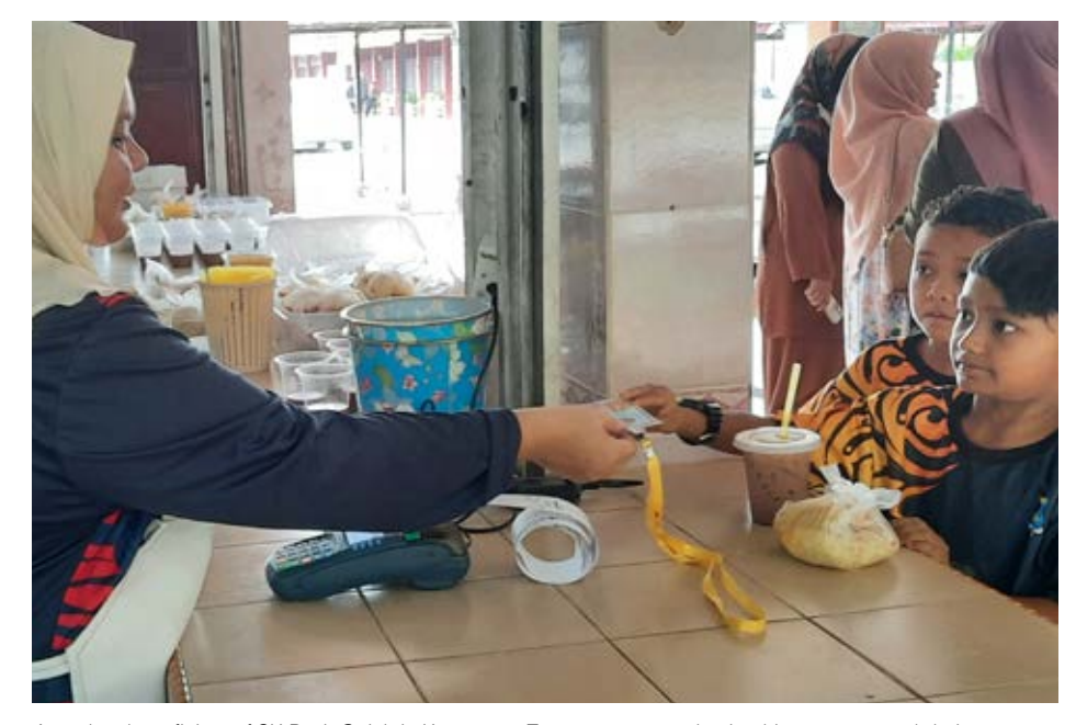
A student beneficiary of SK Pasir Gajah in Kemaman, Terengganu, purrchasing his canteen meal during recess. A card reader is installed at the canteen to allow for cashless payments using the MyKasih student smartcard.