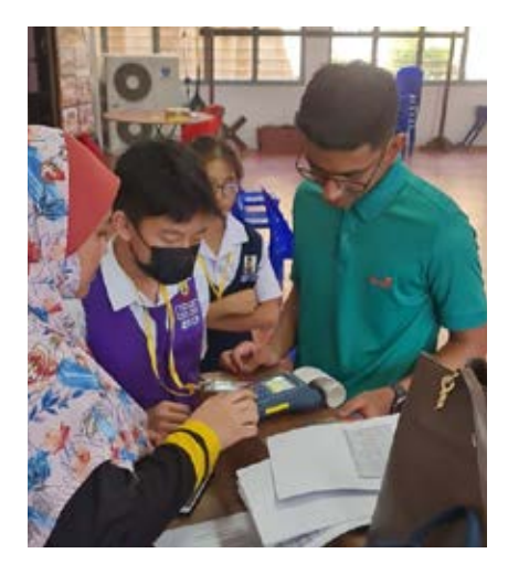
A MyKasih staff teaching students how to draw upon their daily allowances to pay for necessities with their MyKasih-issued smartcard.