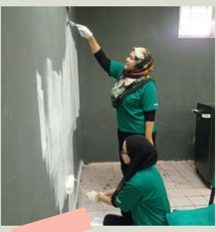
At SK Bukit Lanjan, volunteers gave the hallway and computer lab fresh coats of paint and added soil to the school field to