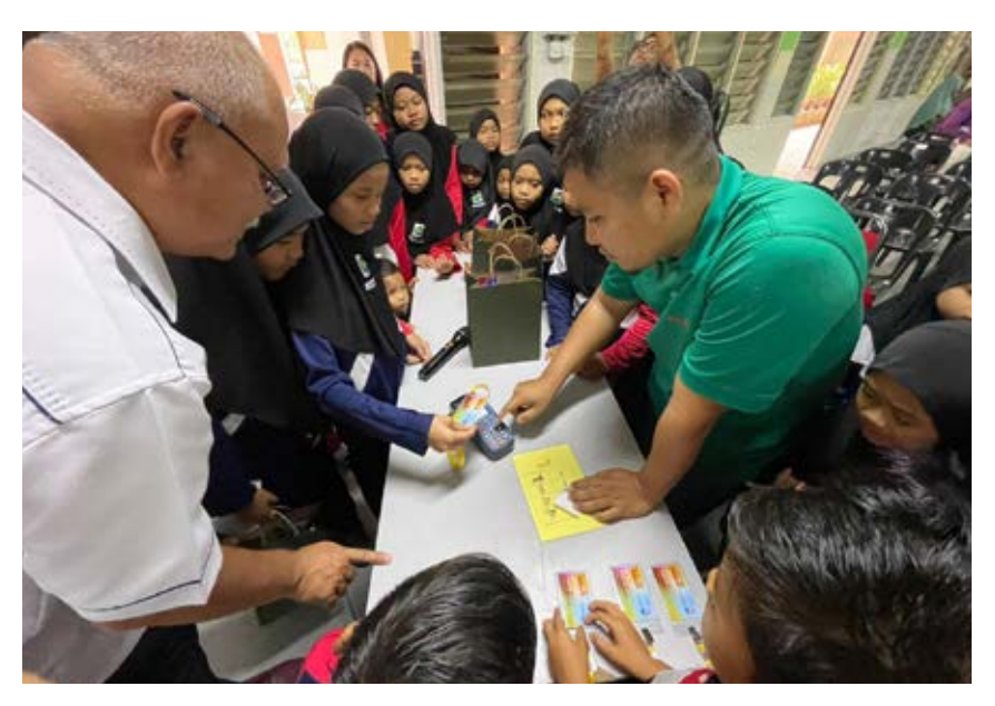
SK Pasir Gogok's headmaster and students were eager to learn about the mechanics of the cashless bursary programme.