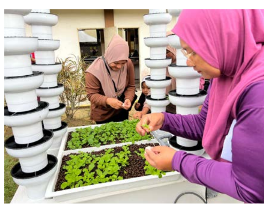
Parents of the students from SK Pasir Gogok were equally as excited about the aquaponic systems as they helped to transplant sprouts to the vertical towers.