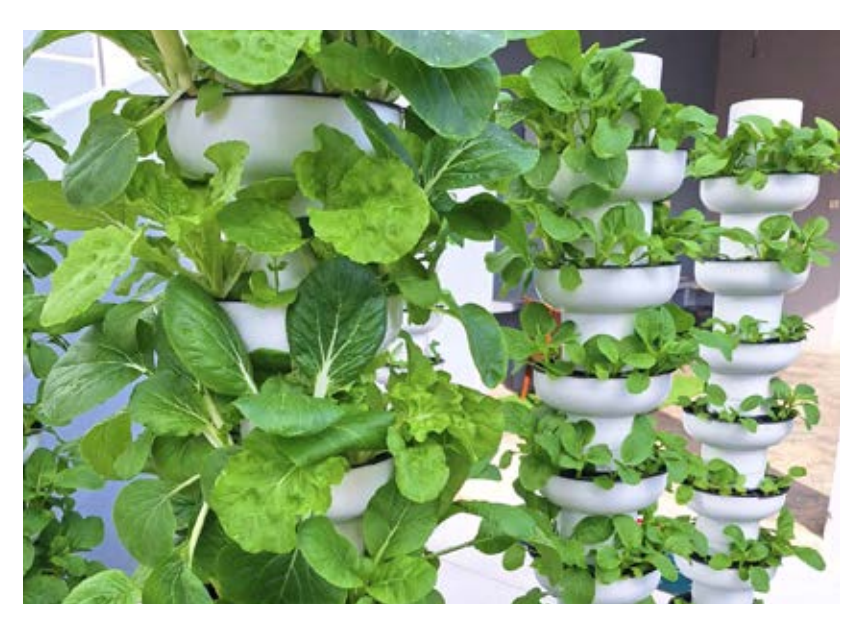
Two of the beneficiary schools, SK Temiang and SK Paya Jakas, had an early start to the project. Their aquaponic systems were installed in December 2023 and by March, the students have enjoyed three harvest cycles of vegetables.