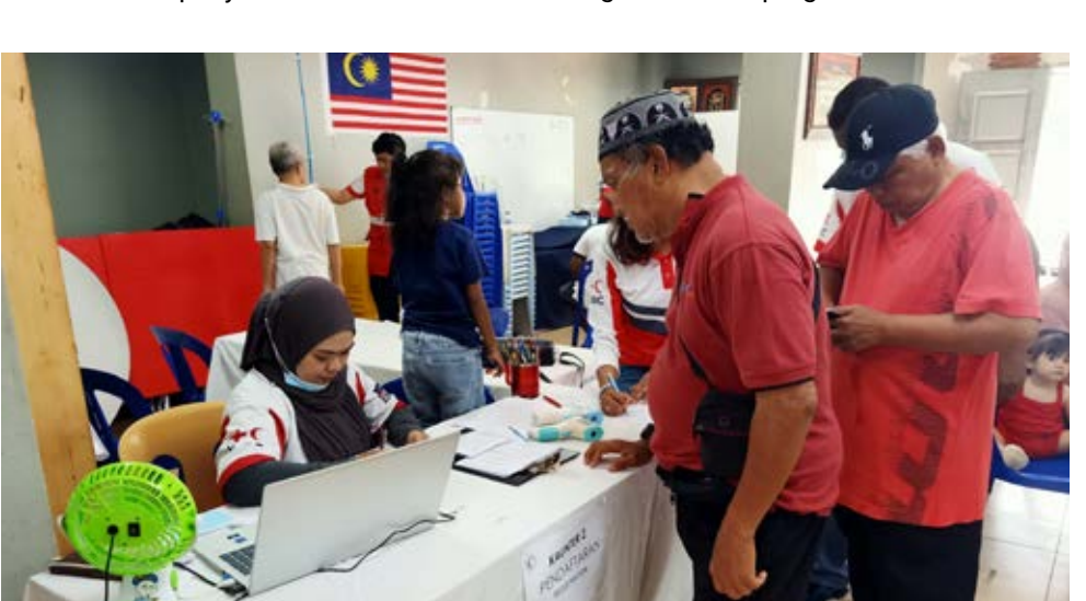
A health check booth was set up by Malaysian Red Crescent Society to test visitors' blood glucose, blood pressure and cholesterol levels

SC Johnson also supported each of the 300 families at PPR Seri Cempaka with a one-off aid of RM300 via their MyKad to purchase essential food items and back-to-school supplies at participating retail outlets under the MyKasih 'Love My Neighbourhood' programme.