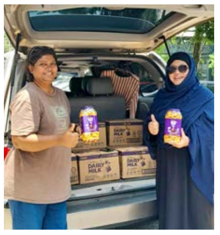
Completed cookies tubs were collected and then delivered throughout the month of Ramadhan.