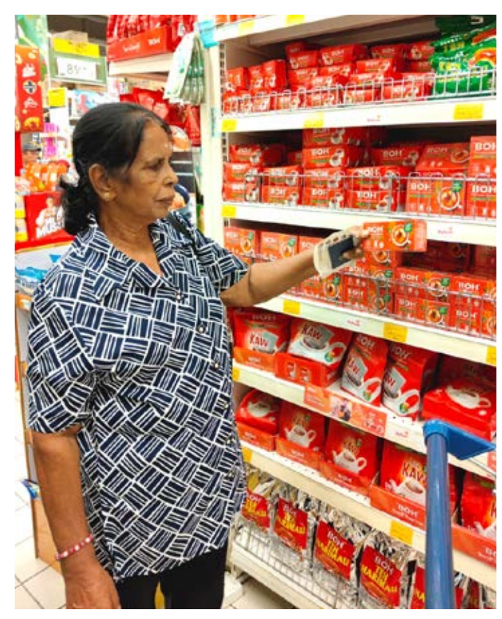
Programme logo labels on the racks help recipients identify the products allowed for purchase under the SARA programme.