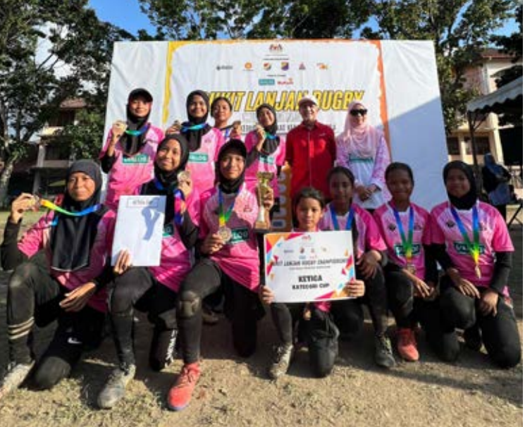
The host school's boys' team, the Lanjan Tigers, finished as runners-up, while the girls' team, the Lanjan Lynx, secured third place. SK Bukit Lanjan was one of only three OA teams in the competition, showcasing their strong performance at the national level.