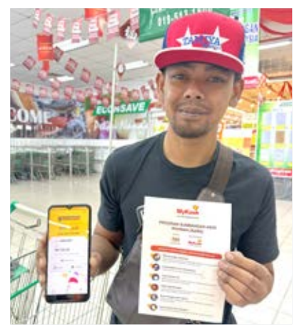
With the MyKasih app, recipients can find the participating retail outlets closest to them, and check their available balances real-time.