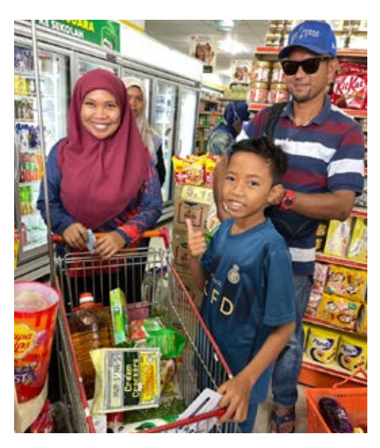
Families in Pengerang were grateful to PITSB for the funds received via their MyKad to shop for groceries.